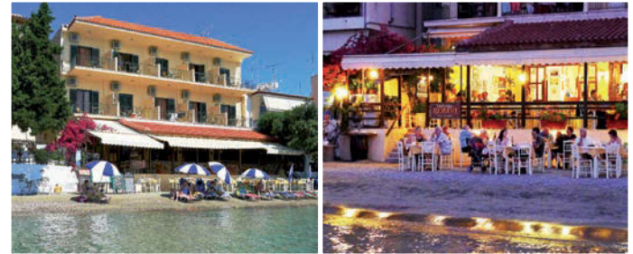
Romvi al fresco dining