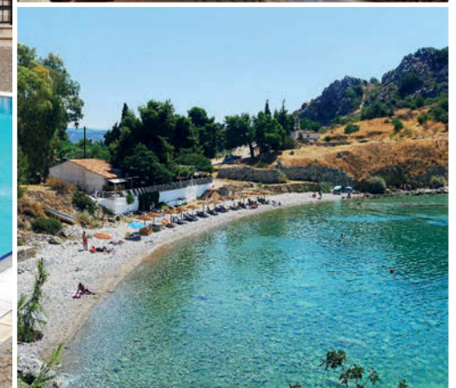
Ancient Assini bay is just over the headland