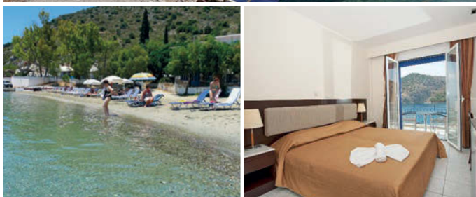
Beach by Hotel Minoa