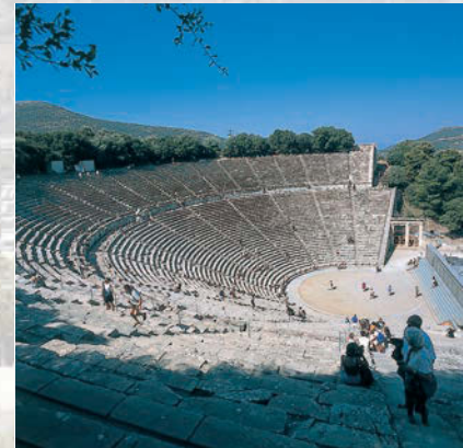
Ancient Epidavros Theatre